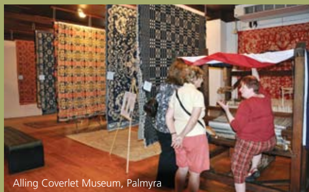
Alling Coverlet Museum, Palmyra

Events and festivals throughout the National Heritage Corridor were counted as a key factor in boosting overall canal traffic in 2009. Cultural, heritage, and recreational events deliver significant tourism and economic benefits to communities, including more than $209 million each year in direct sales revenues in the Erie Canalway (2007 Economic Impact Study , New York State Canal Corporation).