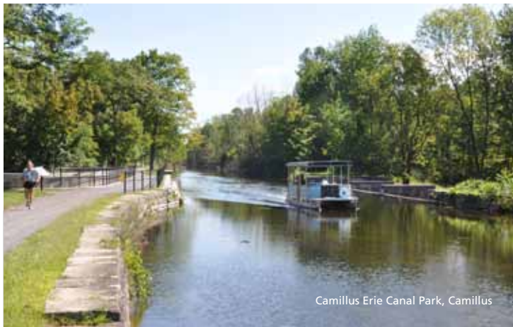
Camillus Erie Canal Park, Camillus