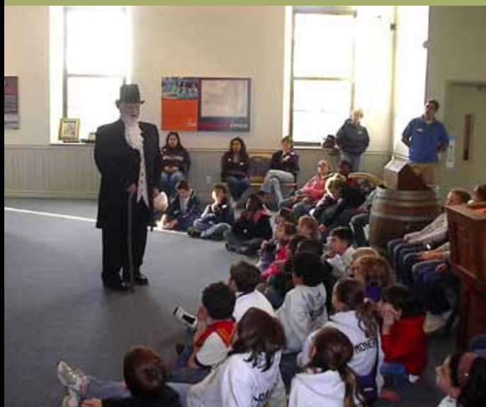
Erie Canal Discovery Center, Lockport

25 canal-related museums and heritage sites