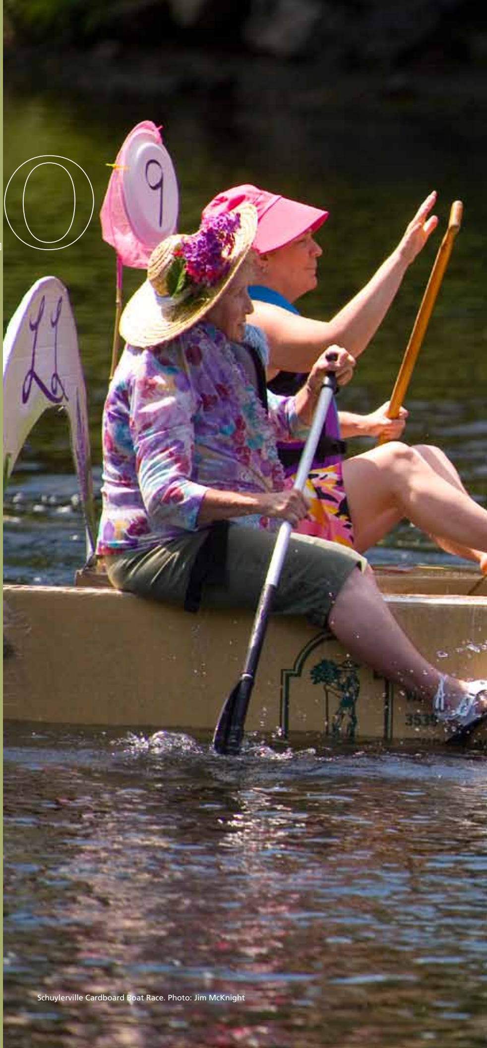
Schuylerville Cardboard Boat Race.

For more information about the programs and projects in this report, visit us online at www.eriecanalway.org .