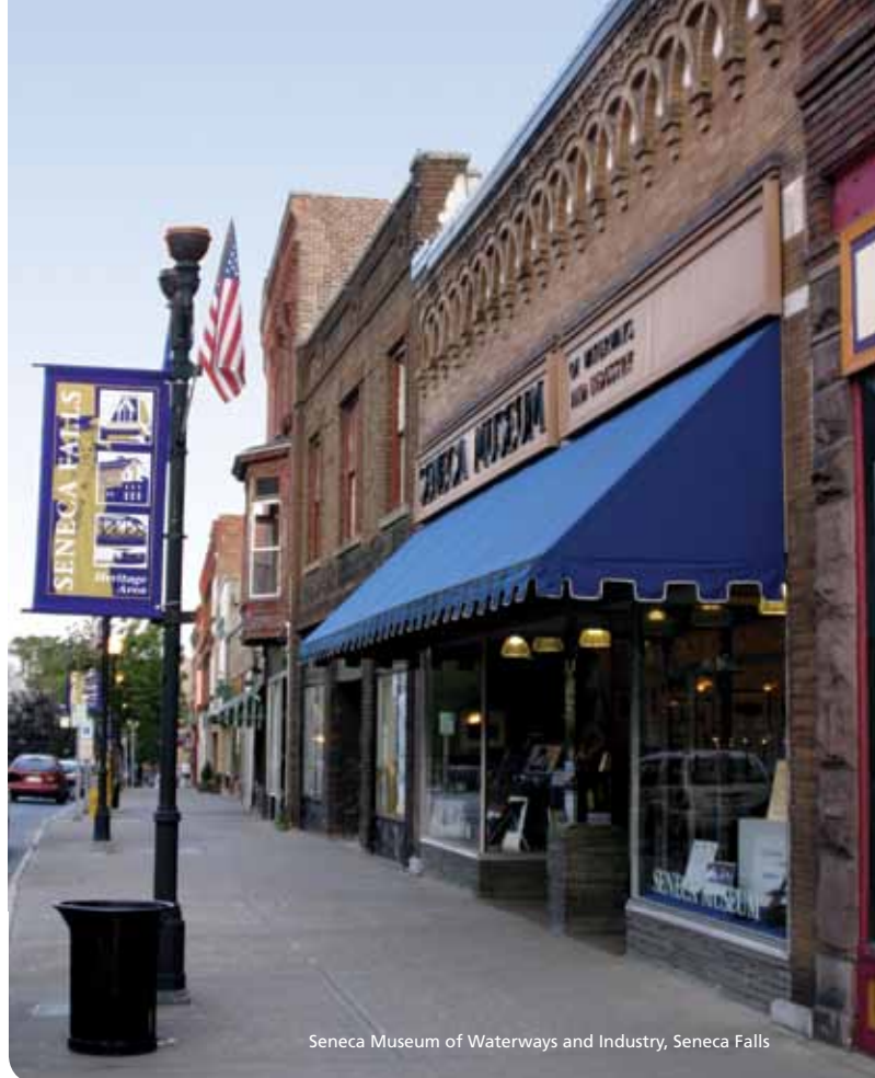
Seneca Museum of Waterways and Industry, Seneca Falls