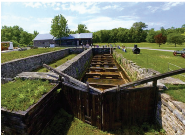
Chittenango Landing Canal Boat Museum, Chittenango, NY

Museums and living history sites like the Chittenango Landing Canal Boat Museum and the Erie Canal Village enable visitors to get a sense of the obstacles that were overcome to build the canal and how its construction changed the landscape of New York State. You can hike, picnic, ride horses, canoe, fish and even snowmobile in winter along the old tow paths.