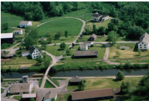
Erie Canal Village, Rome, NY