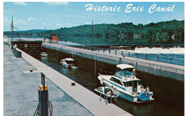
Historic Erie Canal, Postcard, c. 1970